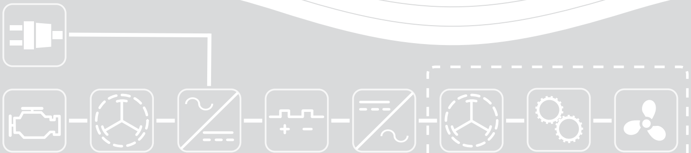
Blockdiagram WhisperDrive 9 Serial hybrid dieselelectric system