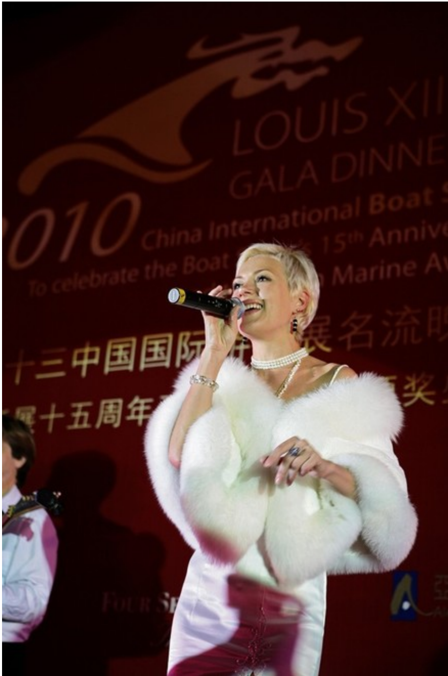
1st Asian Marine & Boating Awards, China International Boat Show 2010. A touch of glamour at the Awards ceremony. - AMBA/CIBS 2010 Click Here to view large photo